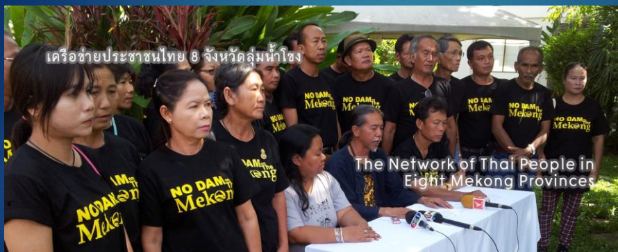
The Network of Thai People in Eight Mekong Provinces